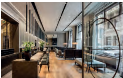
Hotel BoHo, Prague

Hotel Polonia Palace is situated close to the Palace of Culture and Science. The restaurant offers a mix of European and Polish dishes and there is also a lobby bar with live music.