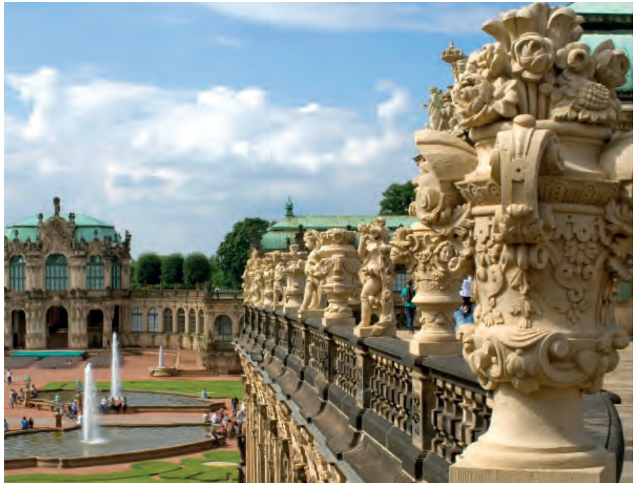
Zwinger Palace, Dresden

Spend your time in Dresden exploring the palaces and historical buildings that the city has to offer. Dresden has a prominent creative scene and is often hailed as the most attractive city in Germany. For history enthusiasts, a visit to Frauenkirche and Neumarkt Square is a must. The Frauenkirche was rebuilt after World War Two and has become a symbol of reconciliation. A fine example of well-preserved Renaissance