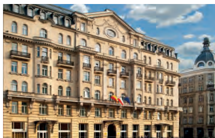
Polonia Palace, Warsaw