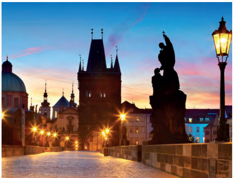
Charles Bridge, Prague

Check out of your hotel after breakfast and travel by rail from Dresden to Prague. The journey will take just over 2 hours. After departure from Dresden, the train runs along the river Elbe (on the left-hand side of the train as you head south). Look out for river boats and the occasional paddle steamer. The last stop in Germany is the pretty spa town of Bad Schandau and the first stop in Czech Republic is Decin where you can observe the Decin