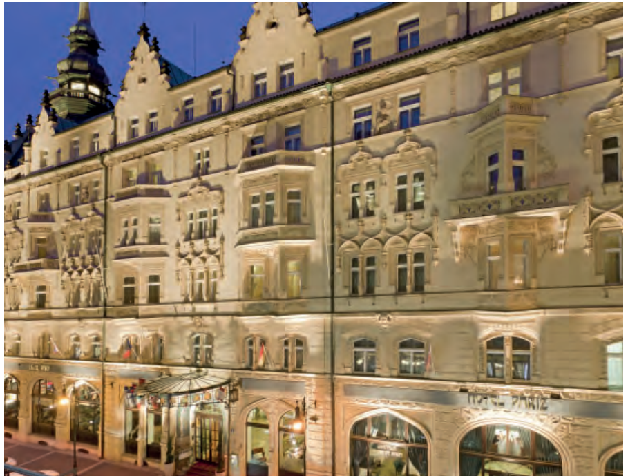
Hotel Paris, Prague

Hotel BoHo is located steps away from the Old Town Square making it an excellent location for exploring Prague, the city of 100 spires. The restaurant offers a range