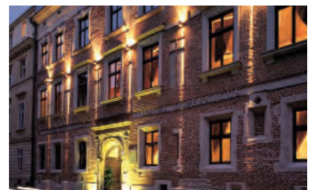
Hotel Copernicus, Krakow