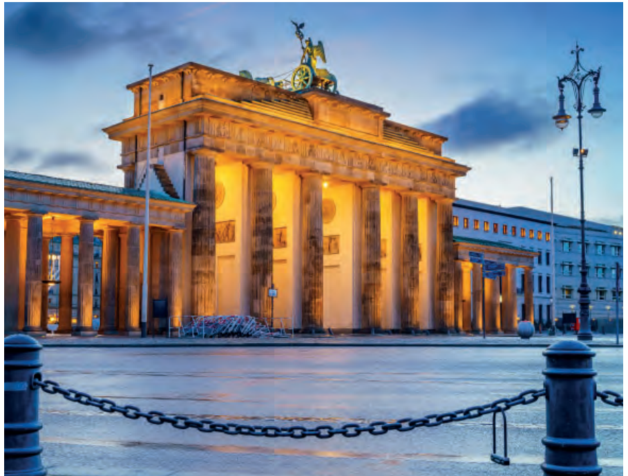
Brandenburg Gate, Berlin

This rail touring holiday links three historical countries, each unique and fascinating in its own way. Begin your rail holiday in Germany, exploring Berlin and Dresden before travelling south to Prague and the ancient capital of Bohemia. Your last destination on this rail touring holiday is Poland, where you can discover the mediaeval streets and splendid, historic buildings of Krakow and the capital Warsaw.